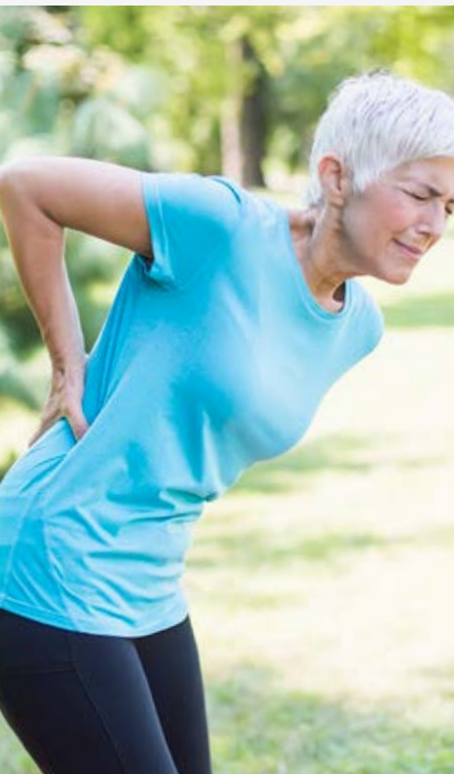
FIGURE OUT WHAT'S FLARING UP YOUR BACK

The biggest problem in Phase 1 is identifying the handful of things you're doing that are aggravating your back. These are the things you can control.